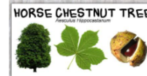
HORSE CHESTNUT TREE