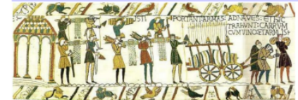
The Bayeux Tapestry shows the Battle of Hastings.

The Normans were people from Normandy in France. They ruled in Britain from 1066 to 1154. They invaded in 1066, nearly one thousand years ago! In 1066, a famous battle took place called the Battle of Hastings . They were led by William the Conqueror.