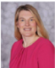
Designated Safeguarding Lead