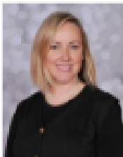
Deputy Designated Safeguarding Lead