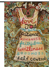
Fruits of the Holy Spirit