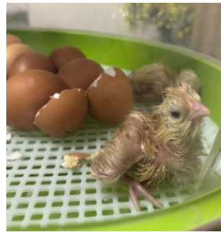
Our last baby chick was born on Thursday